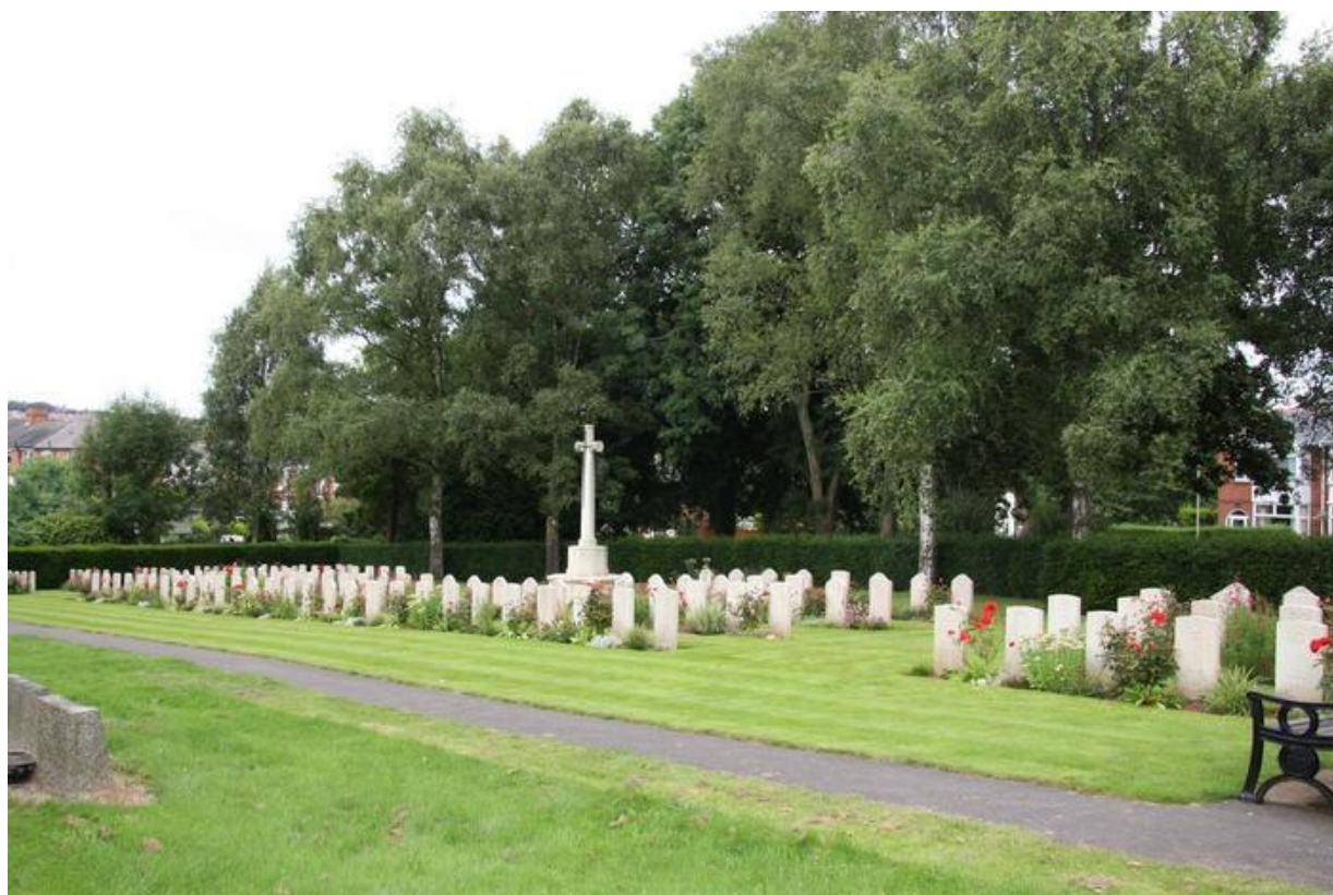
Exeter Higher Cemetery showing Cross of Sacrifice & World War 2 War Graves