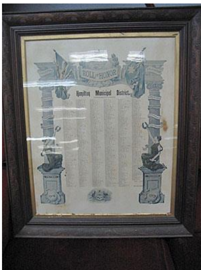
Hamilton Municipal District Roll of Honour