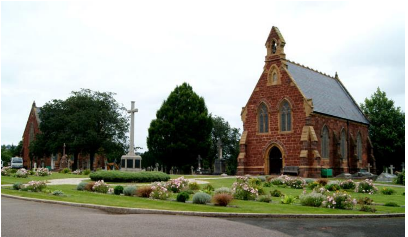
The World War 1 plots near the Memorial with plants & flowers between the named granite grave markers