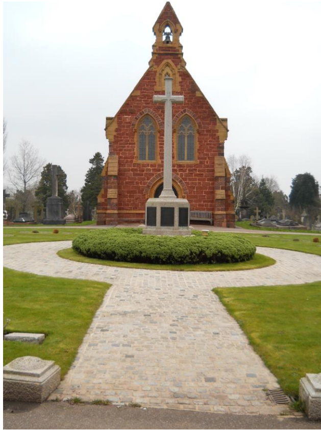
The Memorial (above) & (below) the plaques with the names of the soldiers buried in the World Ward 1 plot.