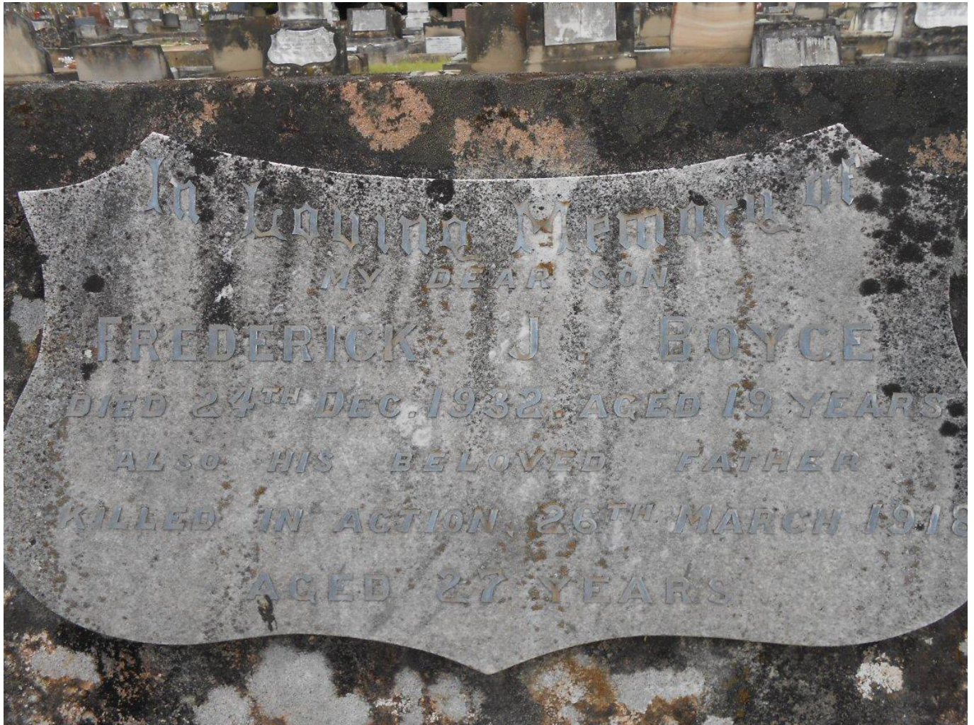
Boyce Grave in Sandgate Cemetery, NSW