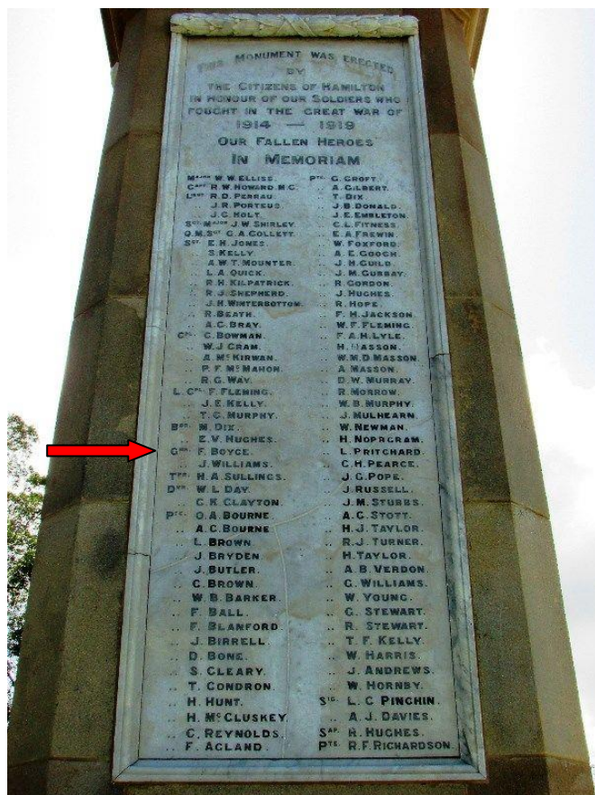
Hamilton War Memorial